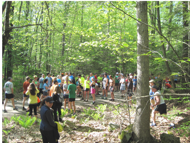
Runners start to gather at the Soapstone starting line.