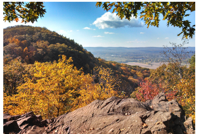
A view from the trail.