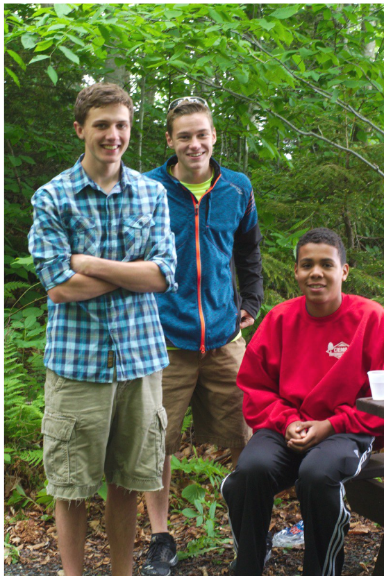
Hoosac Valley High School XC team members manning the Dynamite Trail aid station.