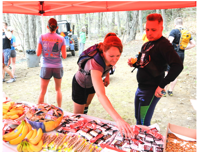
Runners choose from a large selection of treats at the turn-around aid station at the 7 sisters trail race.