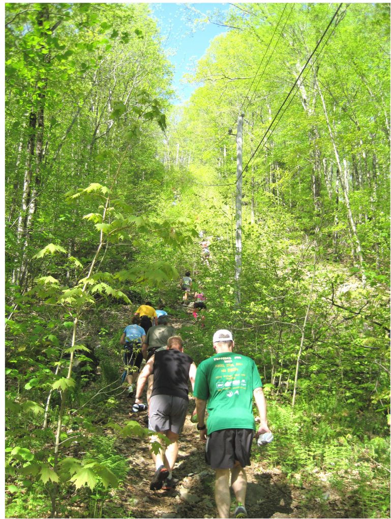
Runners make their way up the famous "Killer Hill" at the 2014 Soapstone trail race.