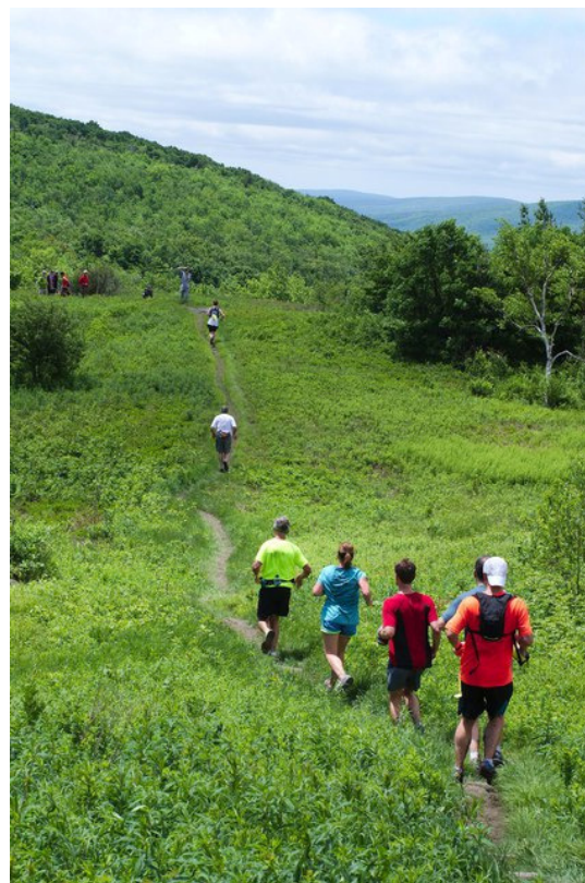
Runners making their way through the field at Jones Nose