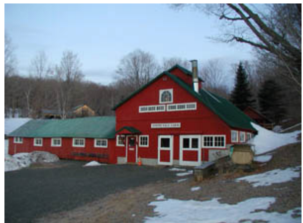
South Face Sugar Farm