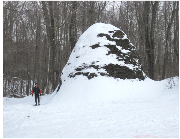
Dan Danecki stands next to the Hawley Kiln at the 2013 race.