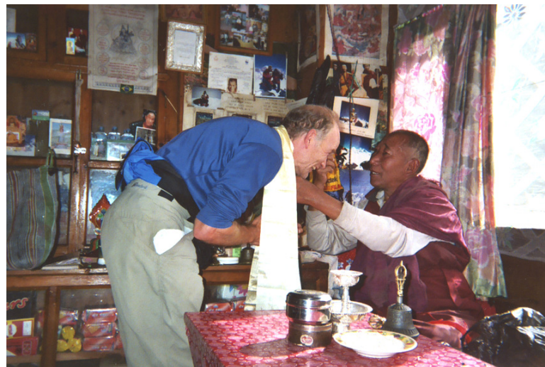
Blessing from Lama of Pangboche