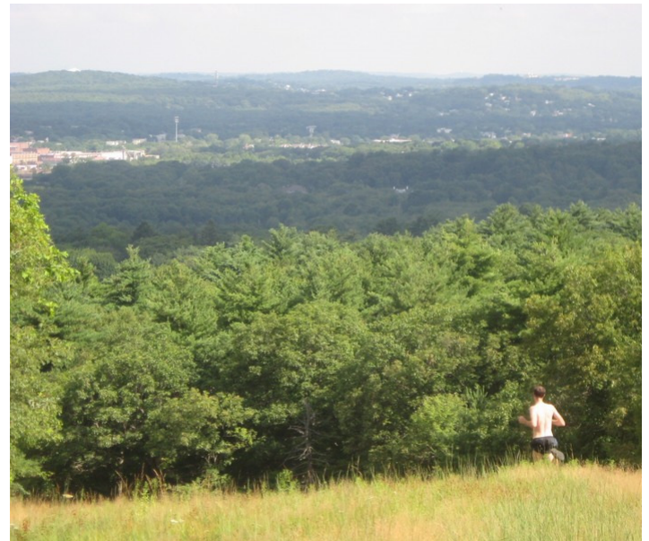
The view from the Blue Hills Skyline Trail