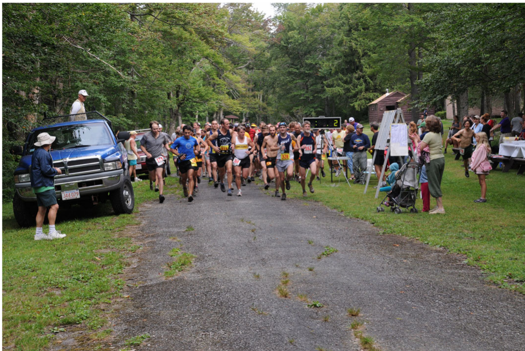
Runners take off at the start of the 2010 Savoy Mt. Trail Races