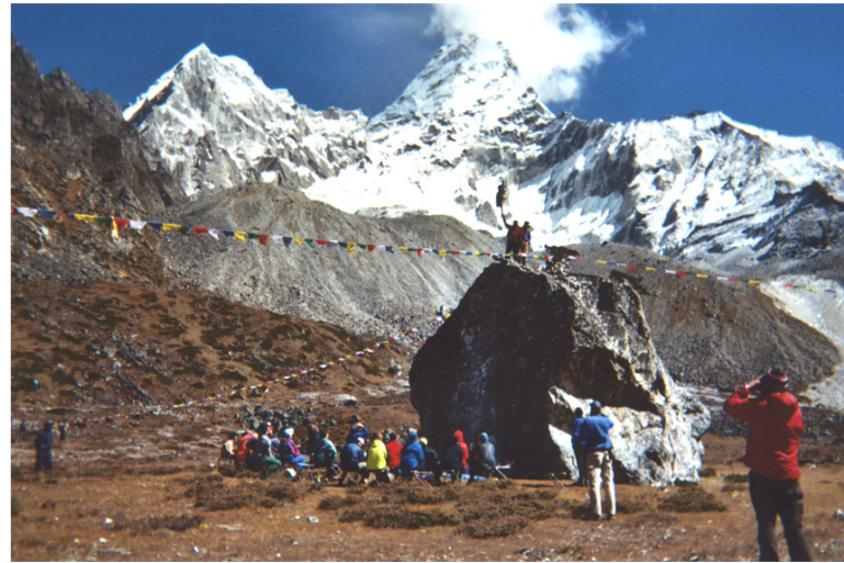
Puja ceremony at basecamp