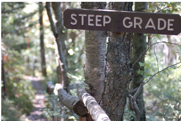
Curly's Trail race