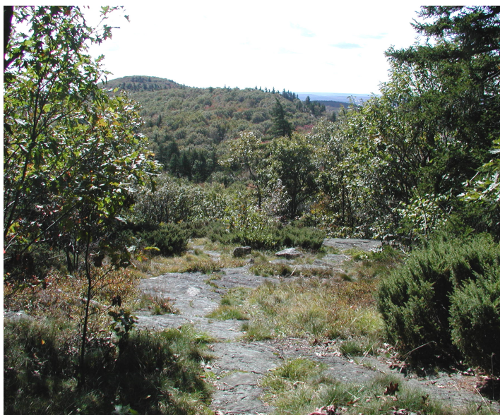
The Wapack Trail along New Ipswich MT.