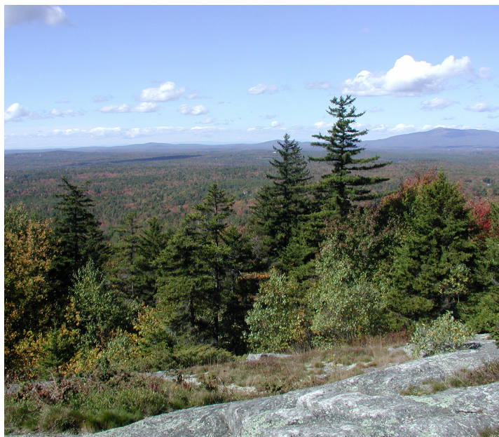
Views from the Wapack Trail