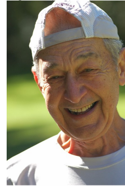
Busa Bushwack Trail Race 10 Miles .... Framingham, MA. .... Nov 1, 2009