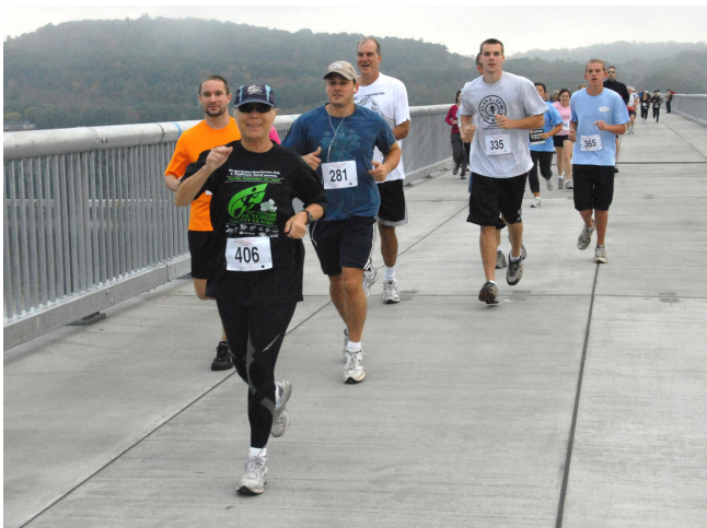
Running across the bridge

Runners eagerly anticipated running across the trestle bridge with spectacular views of the just-changing autumn leaves, the Hudson River, and the Mid-Hudson Bridge, a suspension bridge just south of the Walkway. That is, if they had the chance to see it, as the weather forecast called for “morning FOG”. The Hudson River can generate volumes of it, so thick you cannot see your running shoes. Since park officials insisted on allowing pedestrians on the Walkway at the same time as the 5K, two words came to my mind: Road Kill. I envisioned runners charging blindly through the fog and running over unsuspecting pedestrians.