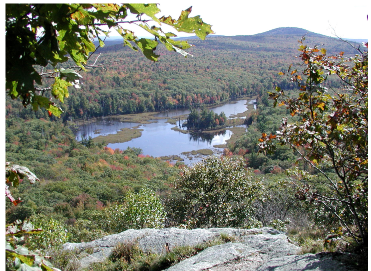
Binney Pond as seen from Pratt MT. This overlook view is located just a short distance off the Wapack trail.